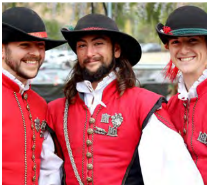
Opening Weekend! September 16th & 17th

Wear your favorite costume and join in the fun at our six theme weekends!