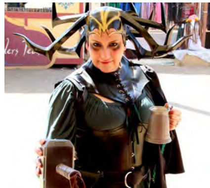
Heroes & Villains September 30th & October 1st