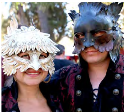
Carnevale & Masquerade October 14th & 15th