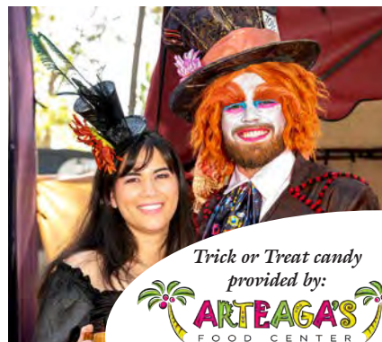
Halloween Fantasy! October 21st & 22nd