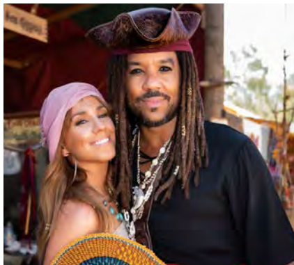
Pirate Invasion September 23rd & 24th