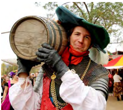
Oktoberfest Weekend October 7th & 8th