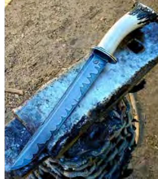
Belmont Blade Works, 311