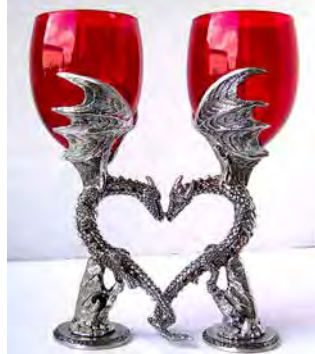
Fellowship Foundry Pewter, 110